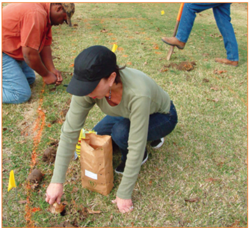
Left: A member of the Clarksdale Garden Club plants a daffodil bulb in the downtown area.