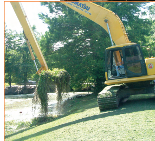
“The Beast” and other machines were recently used to help clear the banks of the Sunflower River in Clarksdale.

Last summer, the Yazoo-Mississippi Delta Levee Board cleared the banks of the Sunflower River between Second Street and State Street in Clarksdale. To take care of the fallen trees and brush piles, the Levee Board used The Beast, the specialized wood chipping machine that the board purchased in 2005. The Beast was first used to assist with Hurricane Katrina cleanup on the coast and again in May in Northern Coahoma County after a tornado and straight line wind left