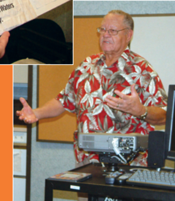
Above: Teachers attend the Levee Education workshop, held each year since 2005 at Delta State University.