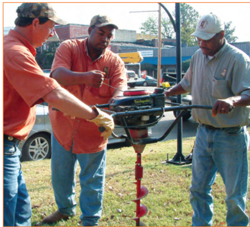
Right: Yazoo-Mississippi Delta Levee Board staff members drill holes for the Garden Club.