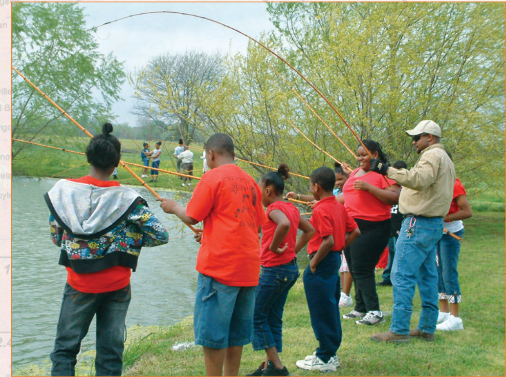
Above: Students and Levee Board staff members participate in a fishing rodeo.